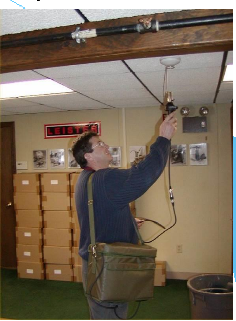
Heat Sensor Testing