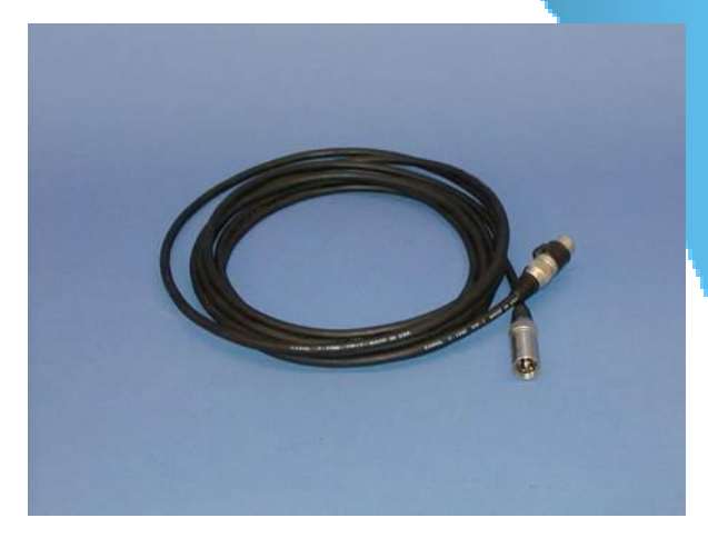
15 foot extension cord MCH-100-CX