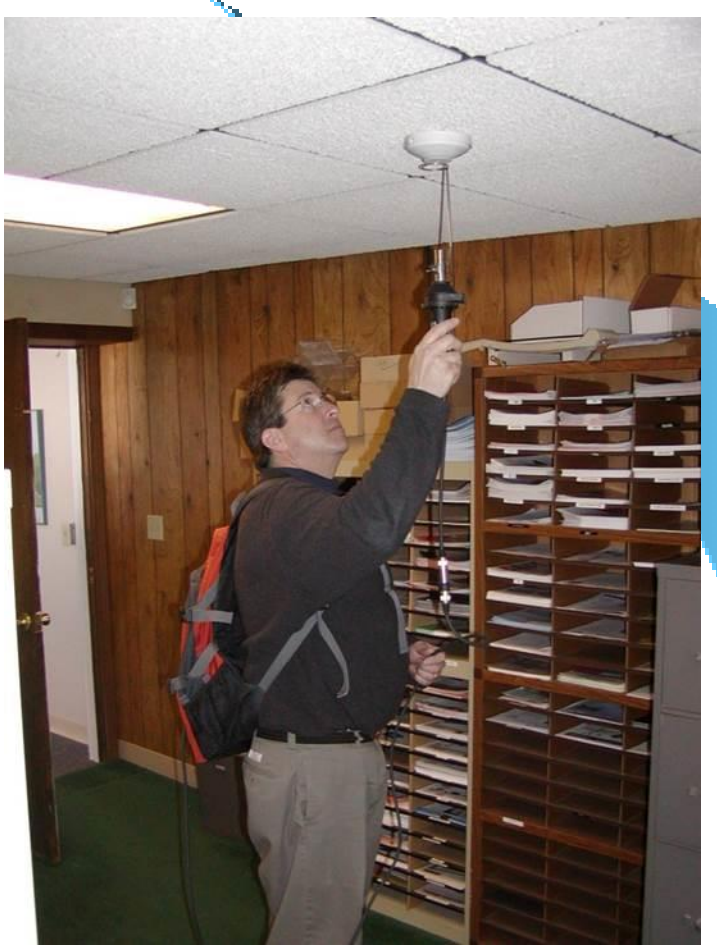
27 pound Battery located in back pack shows portability of MCH-100-C